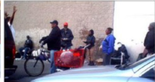
Homeless men, women and children in downtown Los Angeles gets a helping hand from "We Are Our Brother's Keeper" on Dec. 20, 2008.