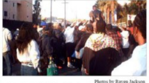
'We are Our Brother's Keeper" distributes backpacks to the homeless.